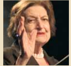
HELEN THOMAS (2005)