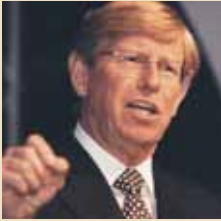
THEODORE OLSON (2003)