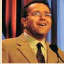
JEFFREY TOOBIN (2004)