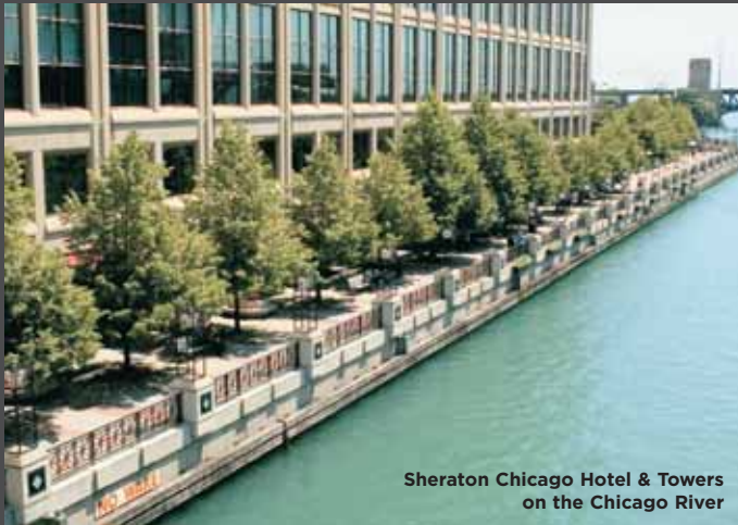
Sheraton Chicago Hotel & Towers on the Chicago River