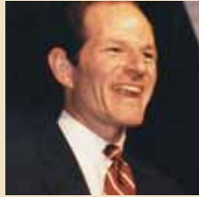
ELLIOTT SPITZER (2003)